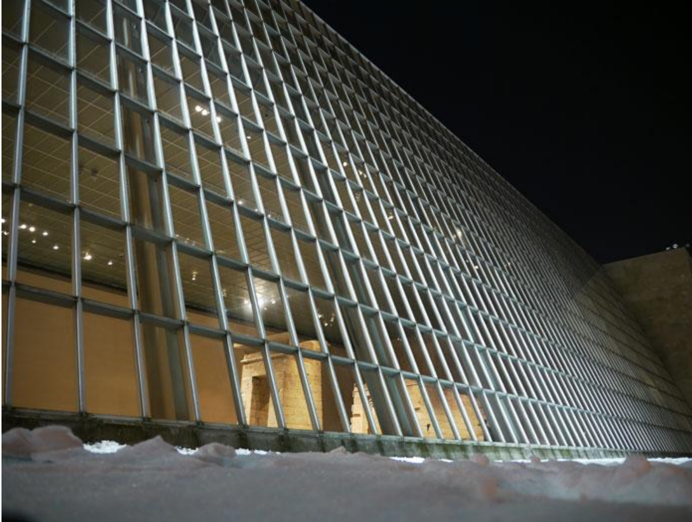
Looking into the Metropolitan Museum of Art's The Temple of Dendur. 10:45 PM.

February 18, 2010. Mild winter's midweek in New York. The skies to the north looked like snow and by late afternoon the weatherman was saying more was on the way. Nope. Most of it has missed Manhattan this year, as it has done for the past several years.