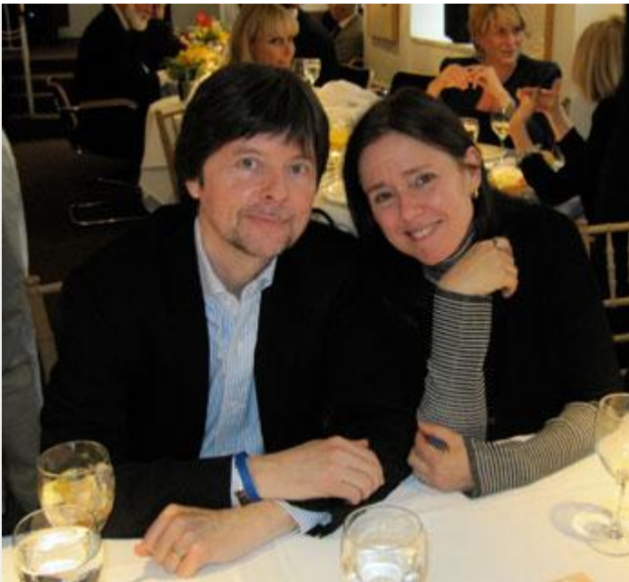
Ken Burns and Julie Taymor