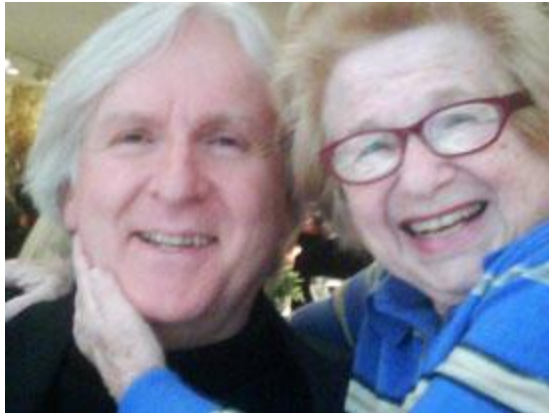
Dr. Ruth with James Cameron.

middle of the front room. One long table and four or five other ones. There must have been about forty guests but we were all packed in together – guests, non-guests, that it was hard to tell the difference.